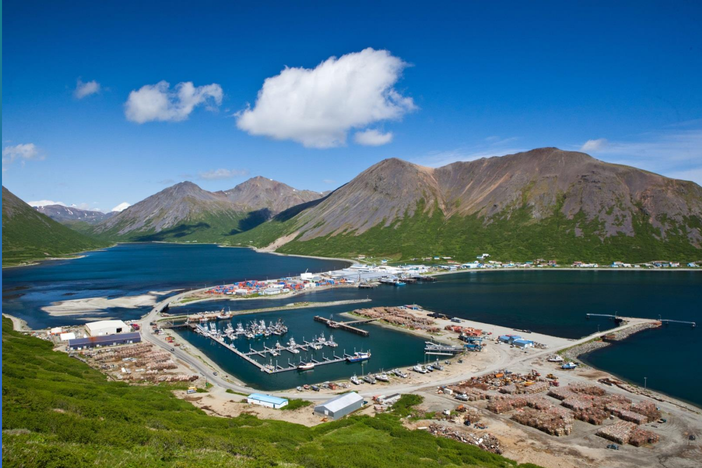
King Cove Waterfront