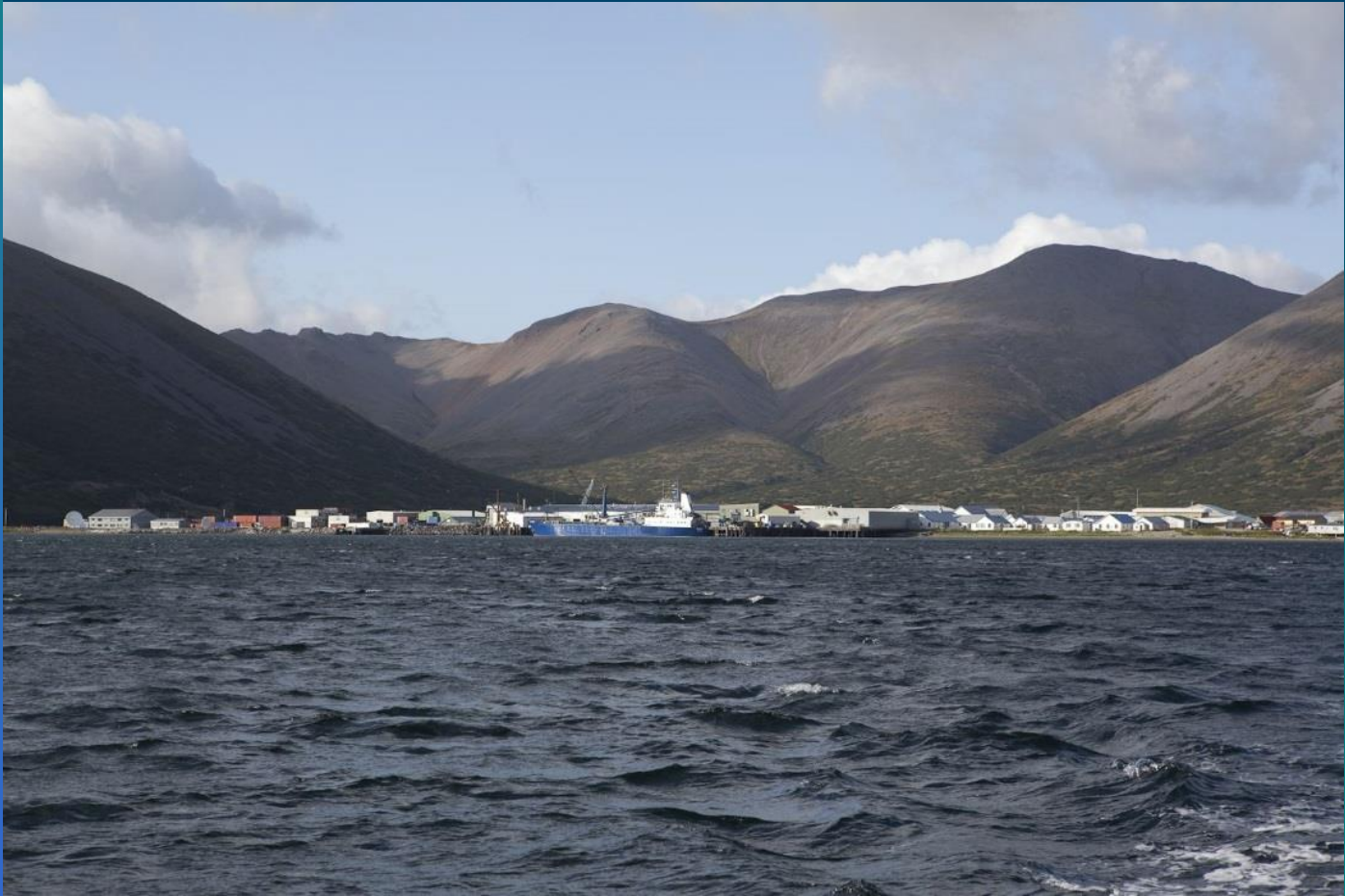
King Cove Waterfront