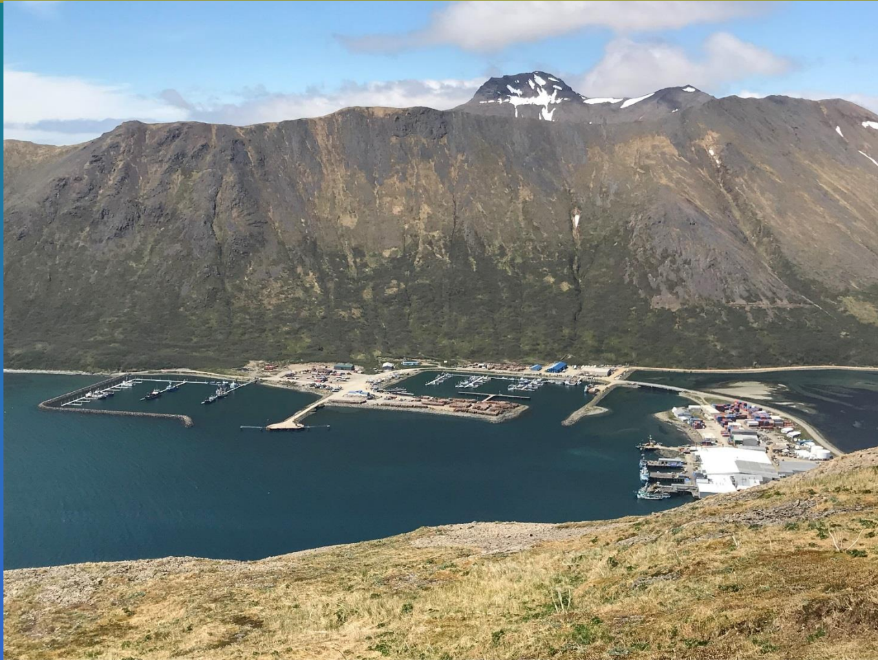
King Cove Waterfront