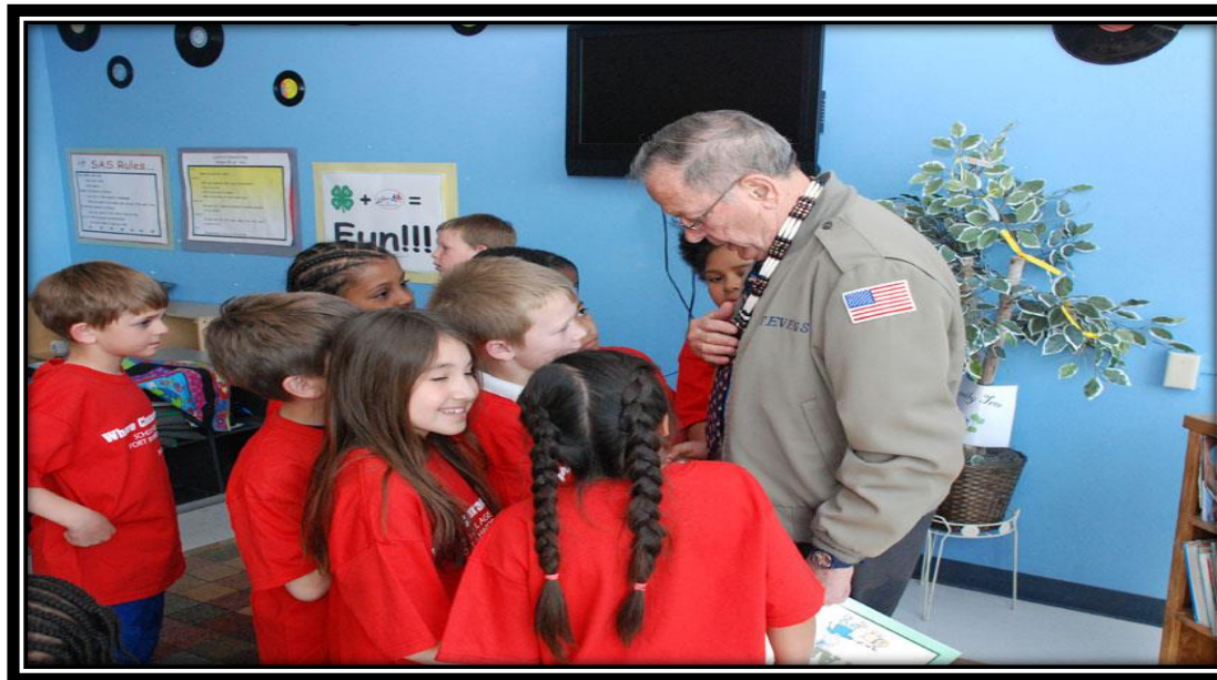
Sen. Ted Stevens